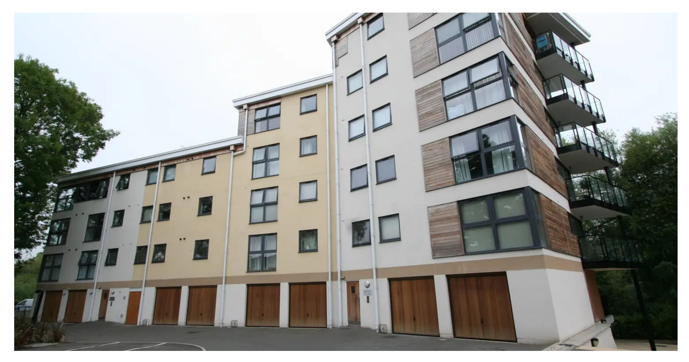
Clifford Way, Maidstone